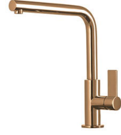
Mixer Tap Omega Copper 8497 400