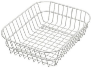
White basket 8612 100